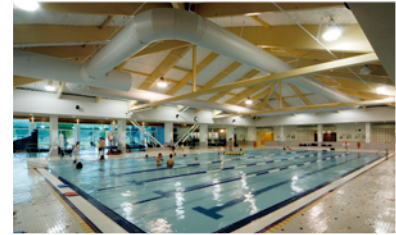
Mission Leisure Centre, Mission BC