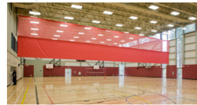
Oliver Woods Community Centre, Nanaimo BC